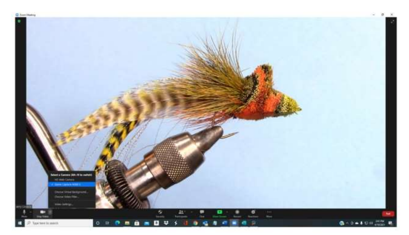
This is a screen shot of the second camera where the fly tying vise is.