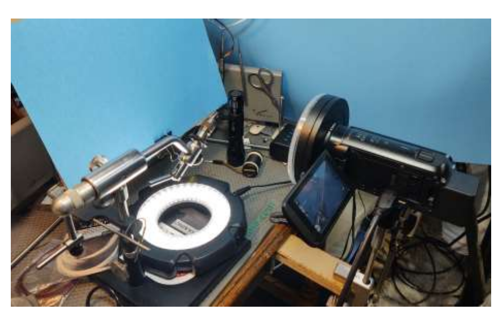
Photo showing the extension of the camera away from the fly tying vise.

Background is supported by the profile plate.